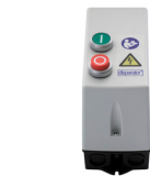
Contactor with motor protector