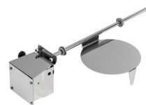
Cover guard for your sink