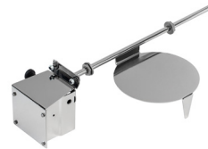
Cover guard for your sink